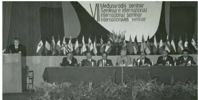
IAEVG Seminar Belgrade 1970

1970 In cooperation with the Ministry of Labour and the Yugoslavian Association of Vocational Guidance the 7 th International Seminar took place in Belgrade, Yugoslavia. The theme focused on Information and guidance in relation to vocational training and the needs of work and employment.