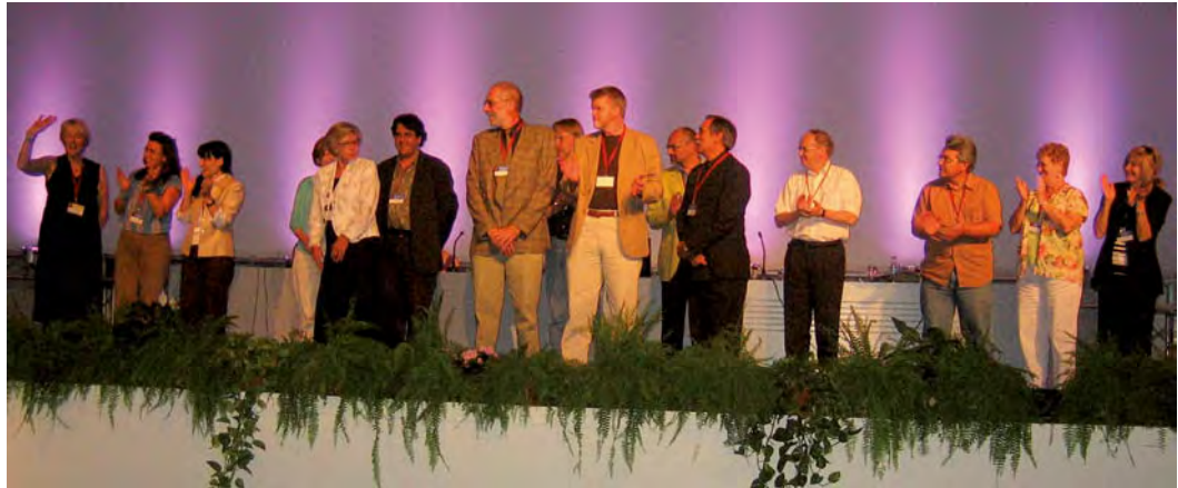
New IAEVG Board on the stage in Padova 2007